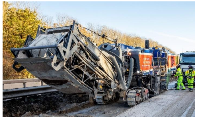
The planer getting ready to begin taking up the old road surface.

We'd like to thank all our customers and local residents for their understanding and patience while we carried out this essential work.