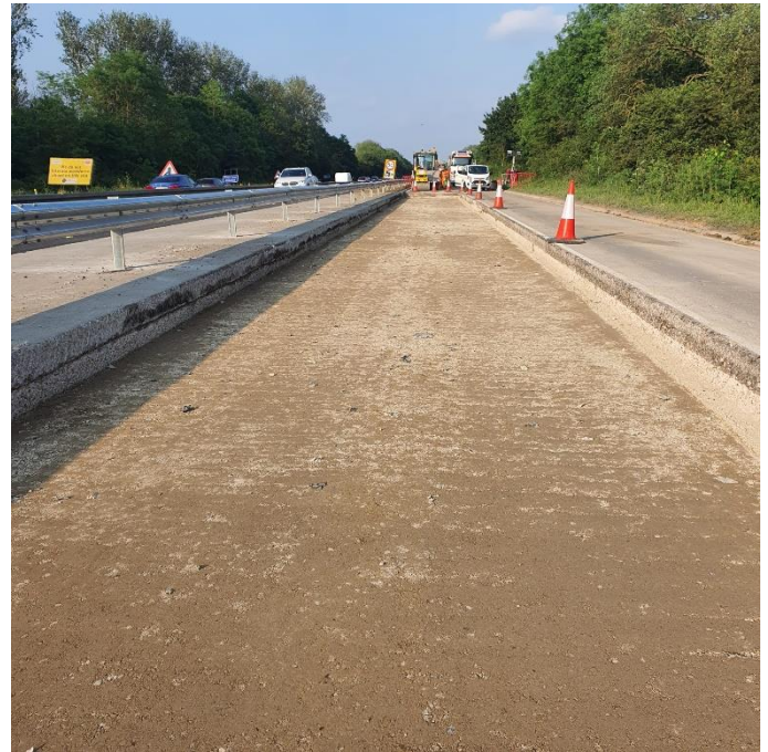
New base layer installation in hard-to-reach areas during our recent weekend works.