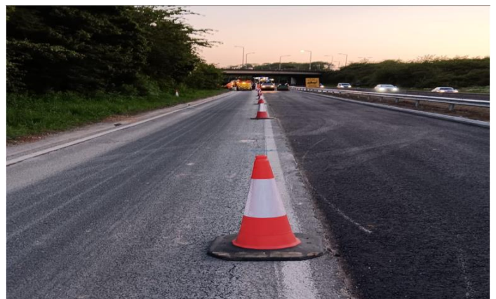
Lane two of the southbound carriageway being reconstructed.

All rebuilt sections of carriageway are currently running on a temporary road surface until the final resurfacing is completed at the end of the project. We apply the final road surface at the last stage to ensure it isn't damaged during the construction work. This also maximises the life of the road surface and ensures a better quality of finish. In the meantime, you might experience some unevenness or bumps on the temporary surface.