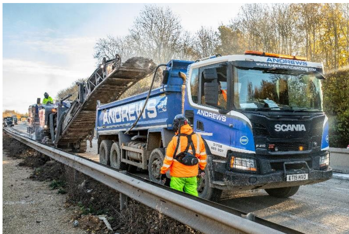
Material being excavated and loaded, to be taken away and recycled

https://nationalhighways.co.uk/A12markstey